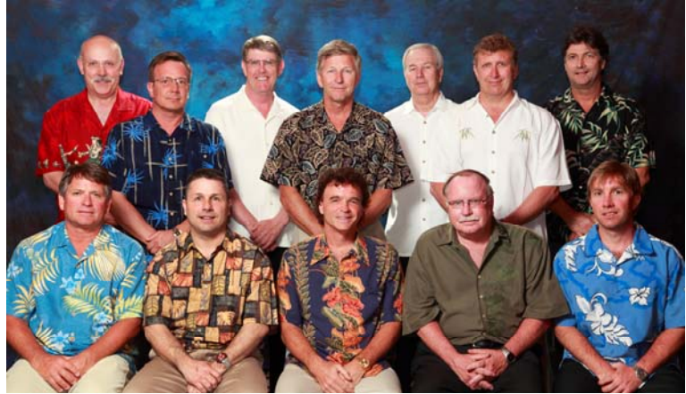
2011-2012 PLCAC Board of Directors