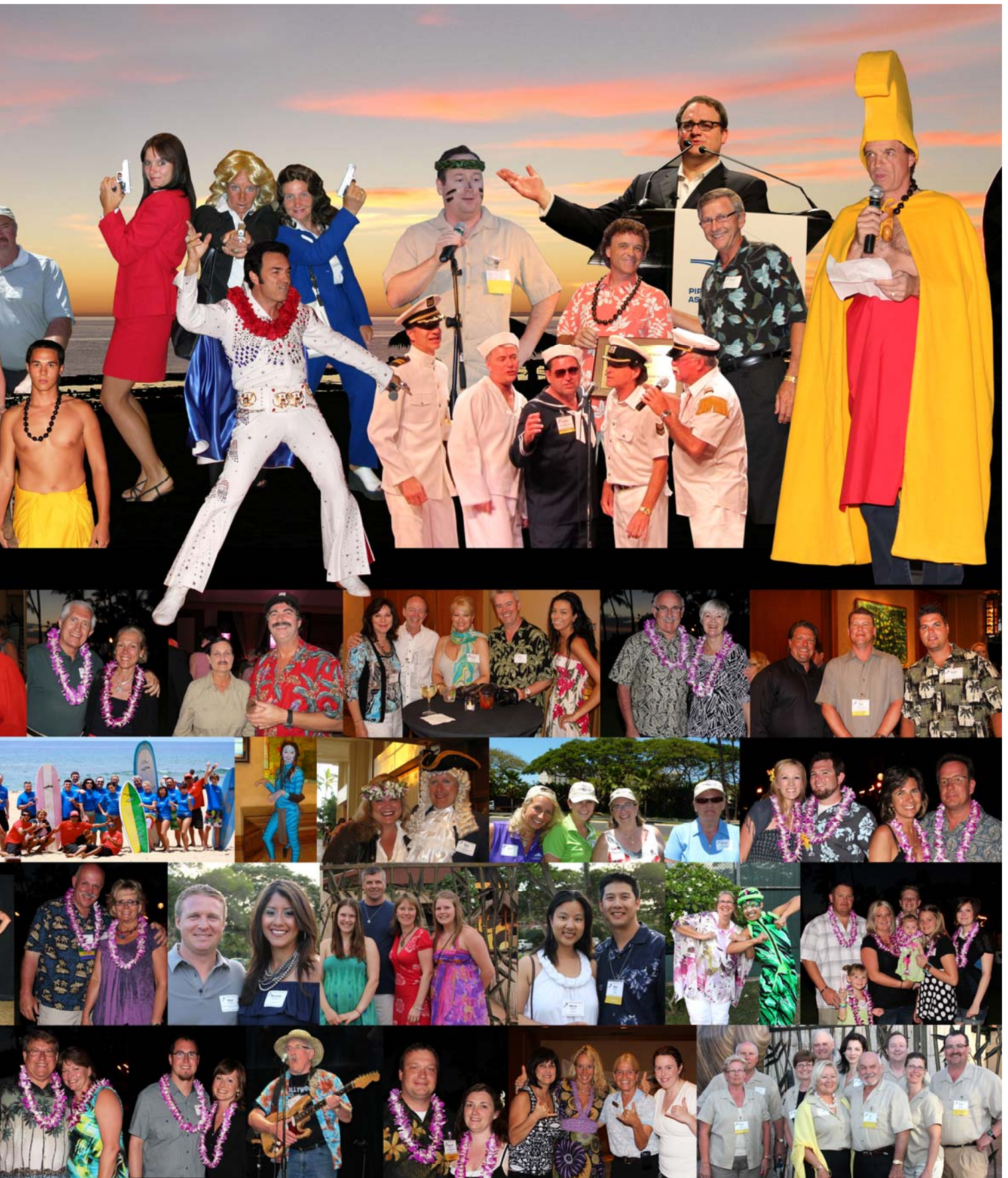
A warm thank you to all of the 2011 convention sponsors